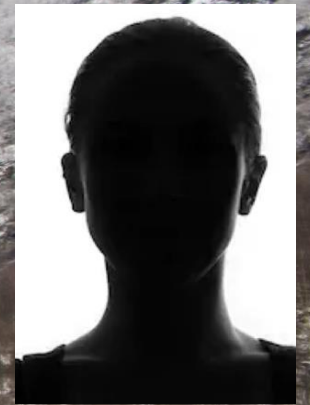
System developer Q4

Q1 2020 – CFO, Supply Chain Manger, Service Technician